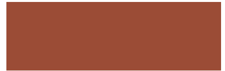
WATERMELON DARK 2 BAGS / 1 YARD